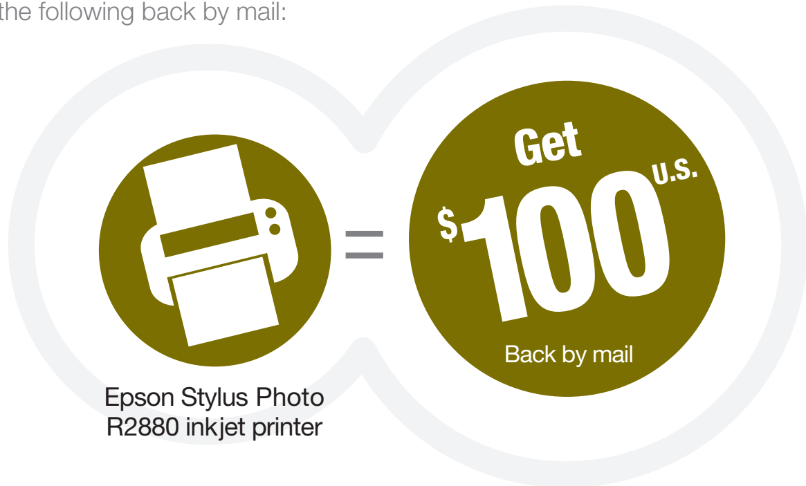
Epson Stylus Photo R2880 inkjet printer

Buy an Epson Stylus ® Photo R2880 inkjet printer and receive the following back by mail: