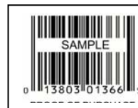
Sample of 12-digit UPC barcode

Mail To: Dept. 97969 PIXMA MP610 or MP970 + DSLR $100 MIR P.O. Box 52981 Phoenix, AZ 85072