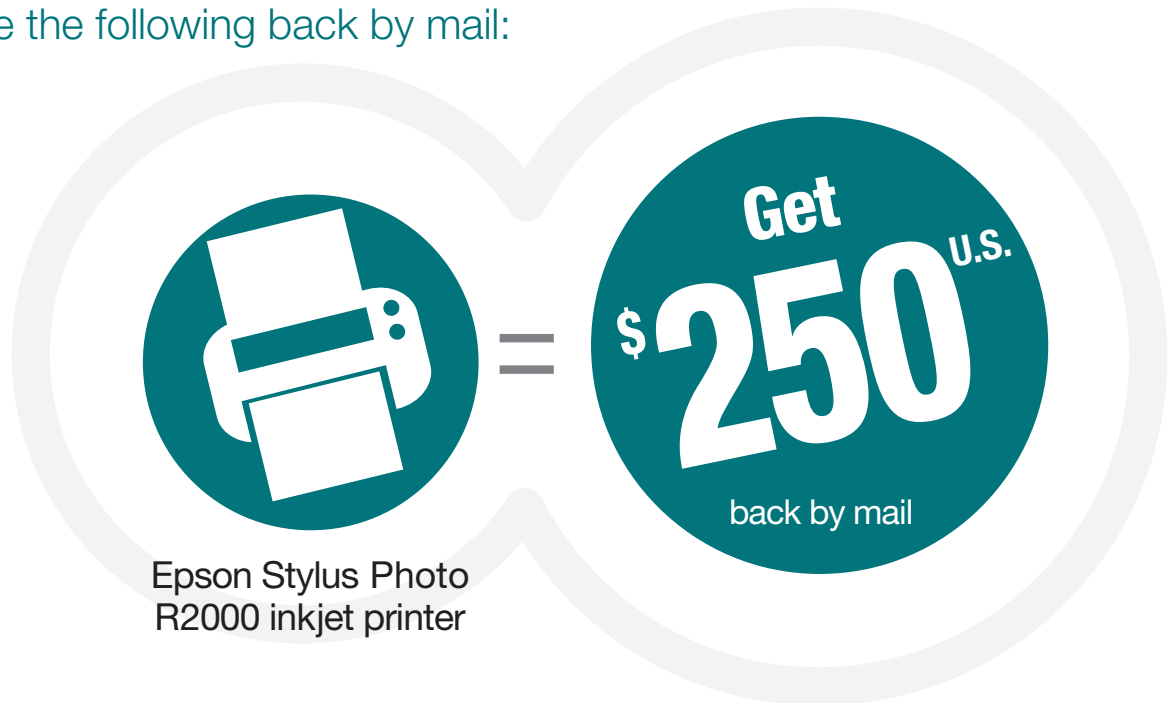
Epson Stylus Photo R2000 inkjet printer

Buy an Epson Stylus ® Photo R2000 inkjet printer and receive the following back by mail: