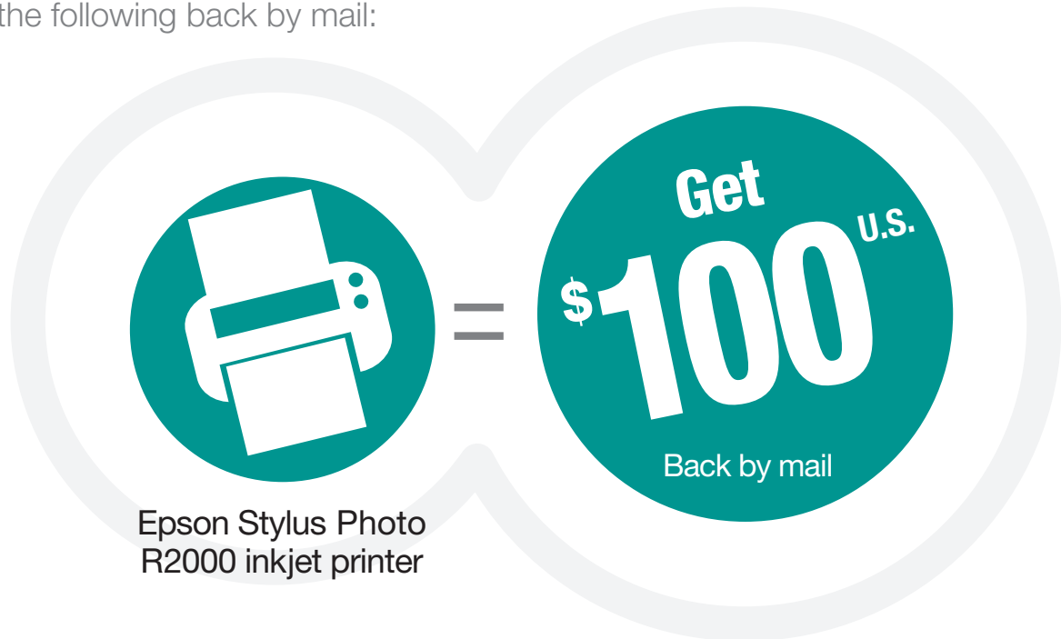
Epson Stylus Photo R2000 inkjet printer

Buy an Epson Stylus ® Photo R2000 inkjet printer and receive the following back by mail: