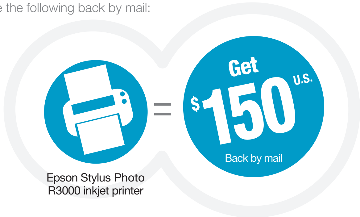
Epson Stylus Photo R3000 inkjet printer

CLAIMS MUST BE POSTMARKED WITHIN 30 DAYS FROM THE PURCHASE DATE. PRODUCT MUST BE PURCHASED BETWEEN 1/1/14 AND 1/31/14.