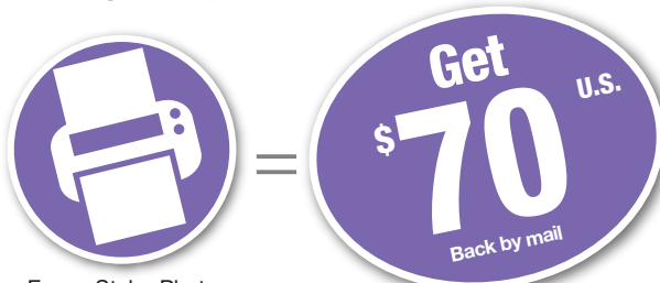
Epson Stylus Photo 1400