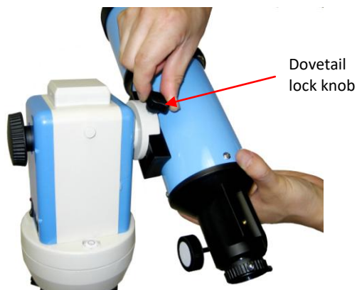
Figure 2. Install the R80 telescope onto a telescope mount

The R80 telescope comes with a Vixen-type dovetail. It can be mounted onto any telescope mount that accepts a Vixen-type dovetail. Just simply release the dovetail locking knob on the dovetail saddle. Slide the telescope dovetail bar in and lock the dovetail locking knob.