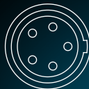
FPPPDG FP POWER PACK F/ FP DG SERIES