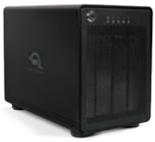
OWC ThunderBay 4 with Thunderbolt 3