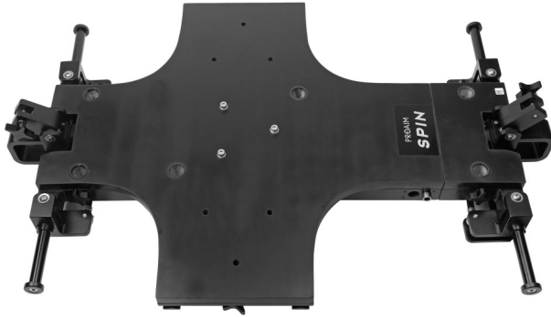
Doorway Platform Dolly

Please inspect the contents of your shipped package to ensure you have received everything that is listed below.