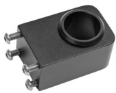
Adapter with 4 x Button Heads