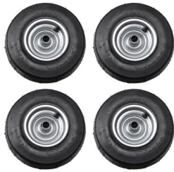
4 x Pneumatic Wheels