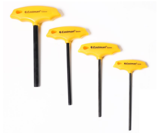
4 x T-Type Allen Key (Size: 10mm, 6mm, 5mm, 4mm)