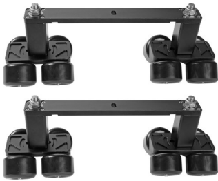
2 x Wheel Tracks