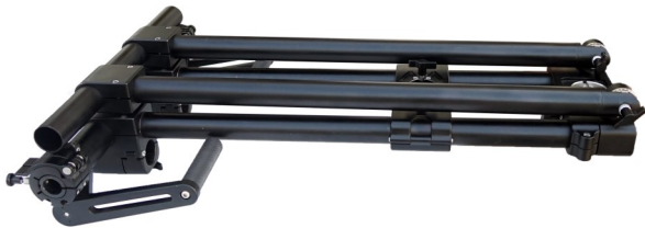
Main Frame of Magnus Camera Rickshaw

Please inspect the contents of your shipped package to ensure you have received everything that is listed below.