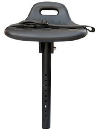
Seat & Seat Post