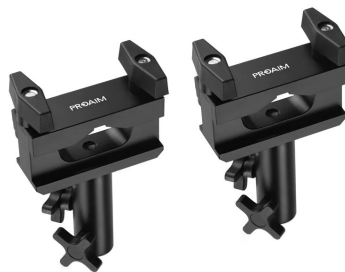
2 x Pipe Support Clamps