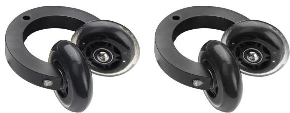
Rig Wheels Monorail Carriage Kit with Two Pipe Clamps

Please inspect the contents of your shipped package to ensure you have received everything that is listed below.