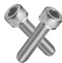
2 x Allen Bolts (Size: 1/4 x 3/8")