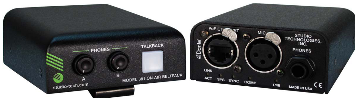
Figure 1. Model 381 On-Air Belt-pack top and bottom views

The Model 381 connects to a local area network (LAN) by way of a standard 100 Mb/s twisted-pair Ethernet interface. The physical 100BASE-TX interconnection is made by way of a Neutrik® etherCON RJ45 connector. While compatible with standard RJ45 plugs, etherCON allows a ruggedized