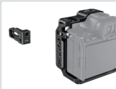
for Sony A7 IV