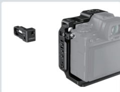
for Sony A7SIII / A1